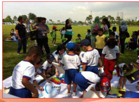
← "Bonding at The Park" at West Coast Park – PCF MacPherson