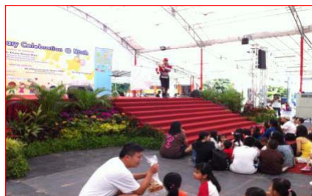
→ Magic show on healthy eating - PCF Woodlands' 25 th anniversary event